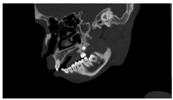
Figure 2: 3D CT scan imaging of third molar