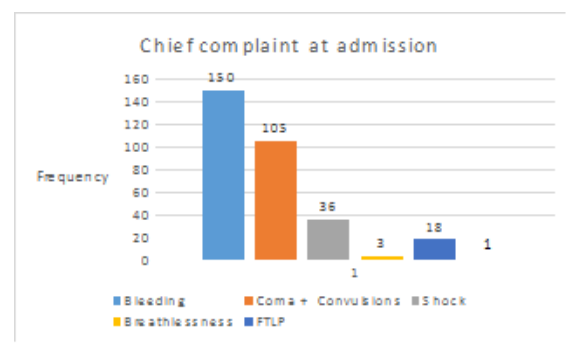
Figure 1: Chief complaint at the time of admission.